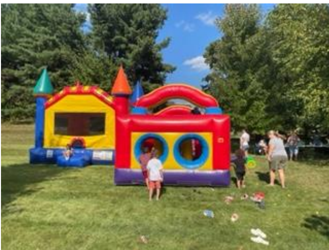
Bounce Houses and slides – ALWAYS a BIG HIT!