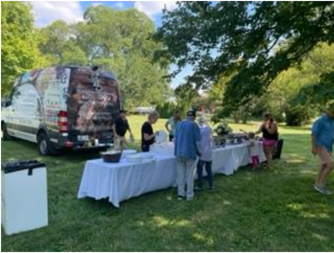
Grabbing a bite to eat from Heitzman's Catering