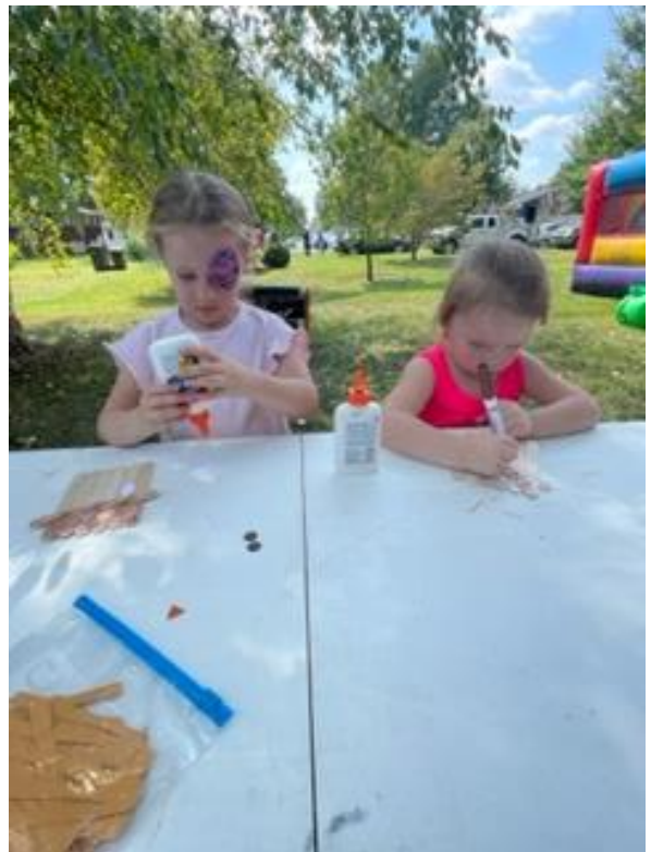
Children got a little crafty and made a fall scarecrow.