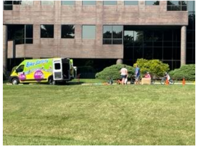
Children enjoyed riding bikes, getting a free bike helmet, and color-changing pencils at the Norton Bike Rodeo.