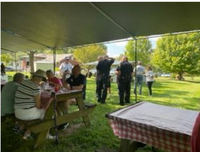
Neighbors and our HA Police Officers enjoying the City Picnic