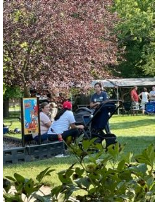
Families & Friends just hanging around!

I would like to personally invite you to the candidate forum to hear about my vision for the park over the next two years. If you have concerns or questions about the park, recreation activities, or playground equipment, please come to the forum or have your questions submitted in advance. I will do my best to answer them.