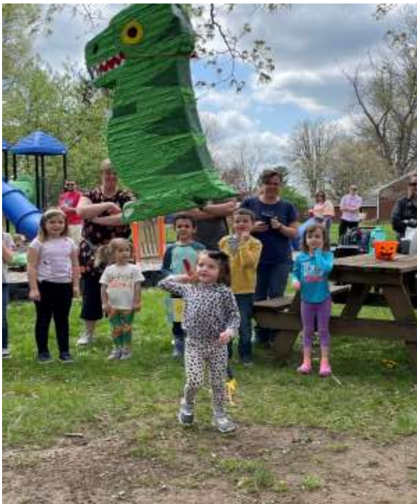
Hitting the pinata always adds fun and excitement to park events.