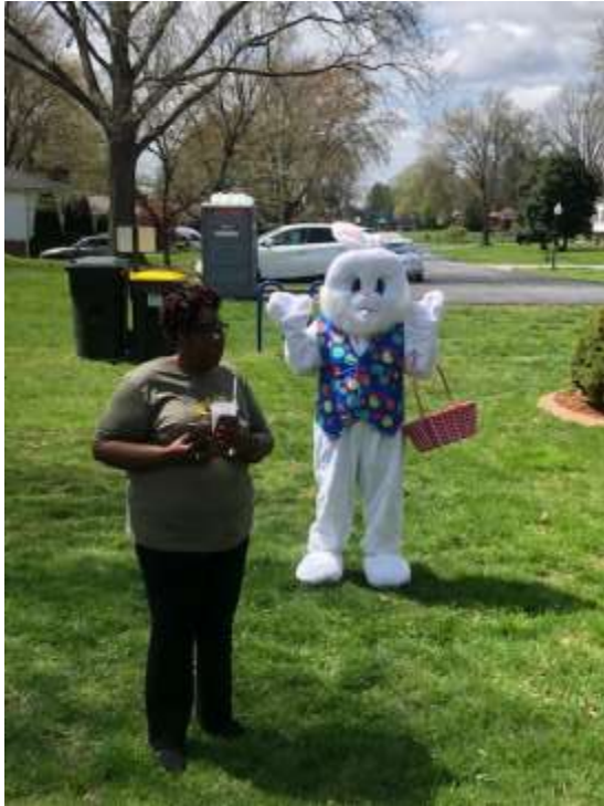
The BEST Easter Bunny in town visited the City of Hurstbourne Acres Easter Egg Hunt.