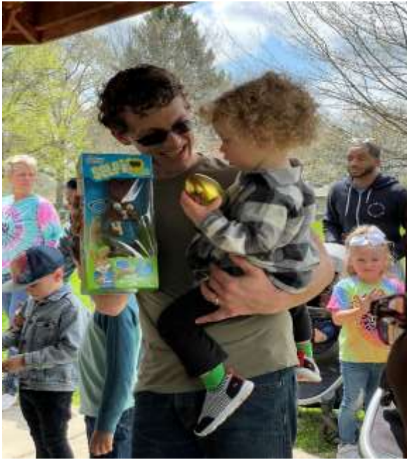
Look at that golden egg and the winner of that chocolate bunny!